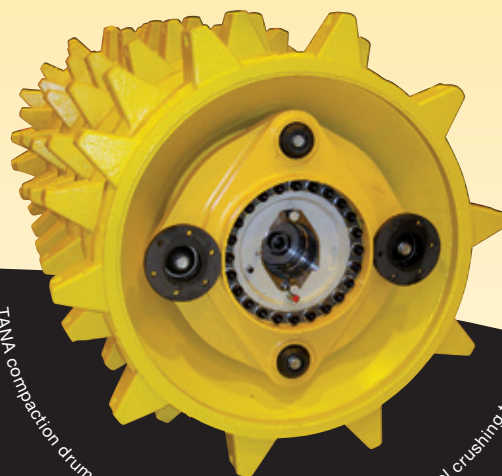
TANA compaction drums – two full width drums with forged solid steel crushing teeth.

Weights and measurements are given within normal tolerances. Manufacturer reserves the right to alter the above as necessary. Some features shown may be optional and not standard.